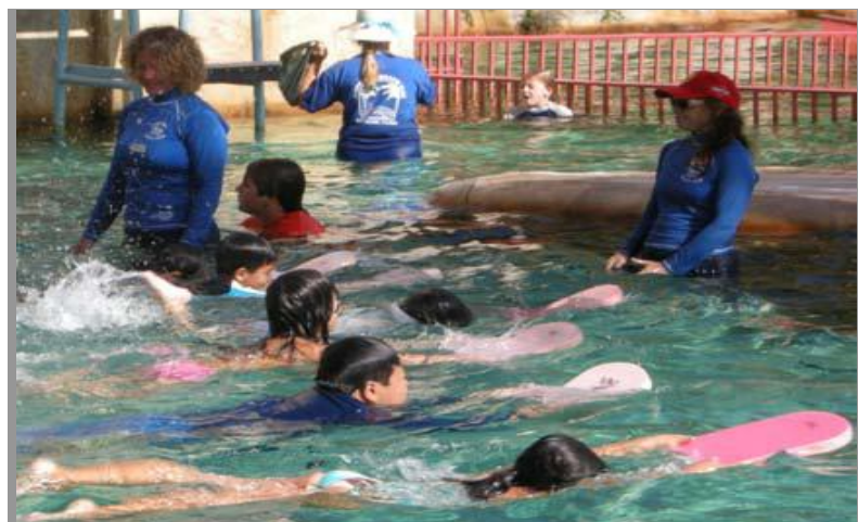
Shallow pool swim class

After successful completion of course, graduates may volunteer to assist swim instructors as Junior Aides to acquire services hours